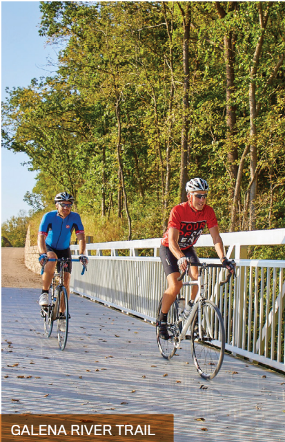
GALENA RIVER TRAIL

is a bit more of an incline, but the spectacular views make for a delightful reward! The Council Ring, a Stonehenge-style amphitheater with giant stone markers that align with the summer and winter solstices, is a great place to take a break! Apple River Canyon State Park is a mix in trail difficulty, but the 26% grade climb to the top of Sunset Nature Trail is no joke. Be sure to take the River Route Nature Trail for even more incredible views.