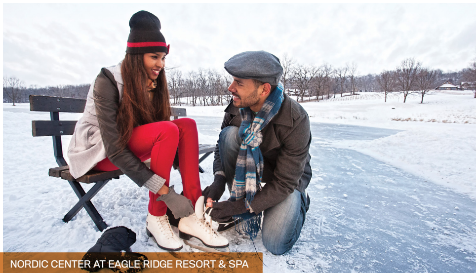
NORDIC CENTER AT EAGLE RIDGE RESORT & SPA