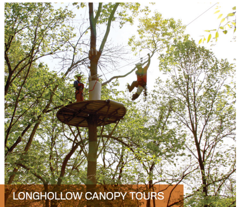
LONGHOLLOW CANOPY TOURS

T ake your trip to new heights with some aerial adventures through Galena Country. You'll love watching the sunset from a hot air balloon with Galena on the Fly . The ride lasts about an hour and you can bring along up to 14 of your friends and family. The pilot will keep you entertained with great stories about the area.