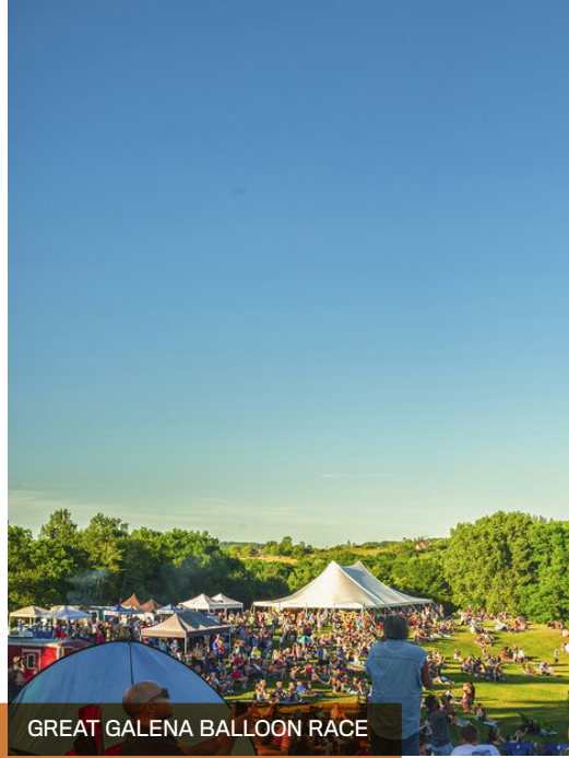
GREAT GALENA BALLOON RACE