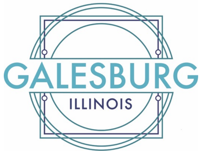
Circular Blue, Solid

Multiple versions of the logo are available to suit any need.