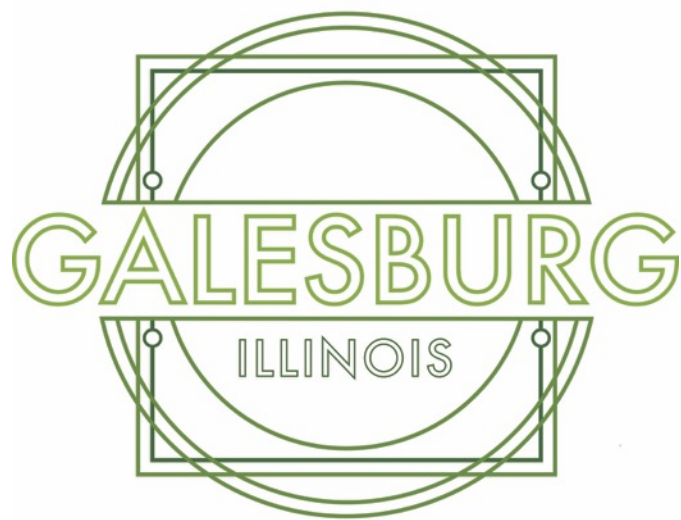
Circular Green, Outlined