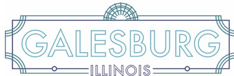
Horitzontal Green, Solid and Outlined